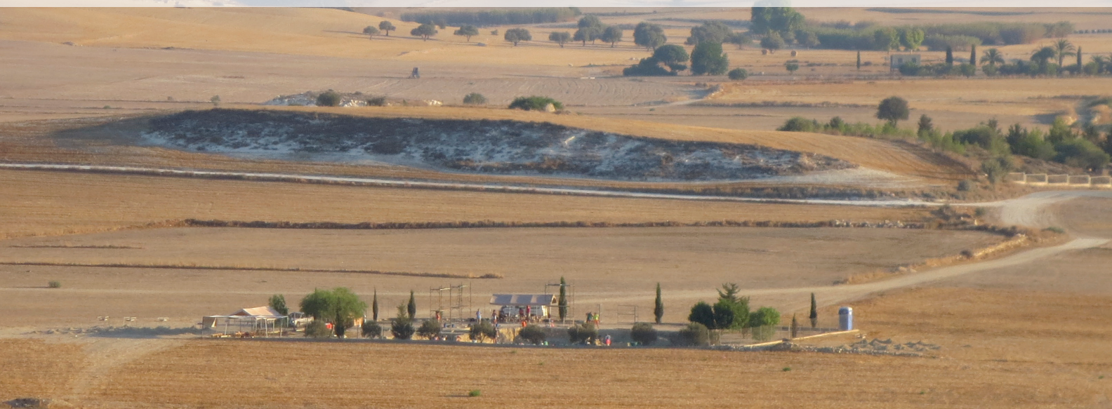
Figure 1. The Malloura Valley. Sanctuary of Athienou-Malloura in foreground.