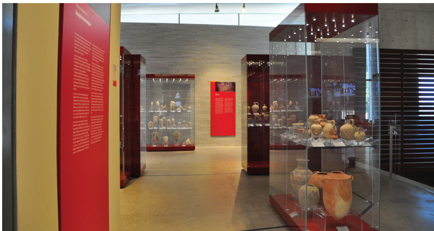
Figure 8. Kallinikeio Municipal Museum, Athienou. Archaeological collections.

of a reciprocal gift-exchange that has deep roots in Cypriot and Mediterranean culture. Nonetheless, our hosts are under no obligation to us, especially the contingent of students that changes on an annual basis. Numerous friendships have blossomed over the years between the locals and project members, and when given the opportunity, AAP members have acted to repay the generosity we have received when local Athenities visit the US on vacation or, in other cases, attend universities as students.