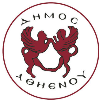
Figures 5a–b (below). Logos for the (a) town of Athienou and (b) the Athienou Archaeological Project. AAP logo design by D. Coslett.