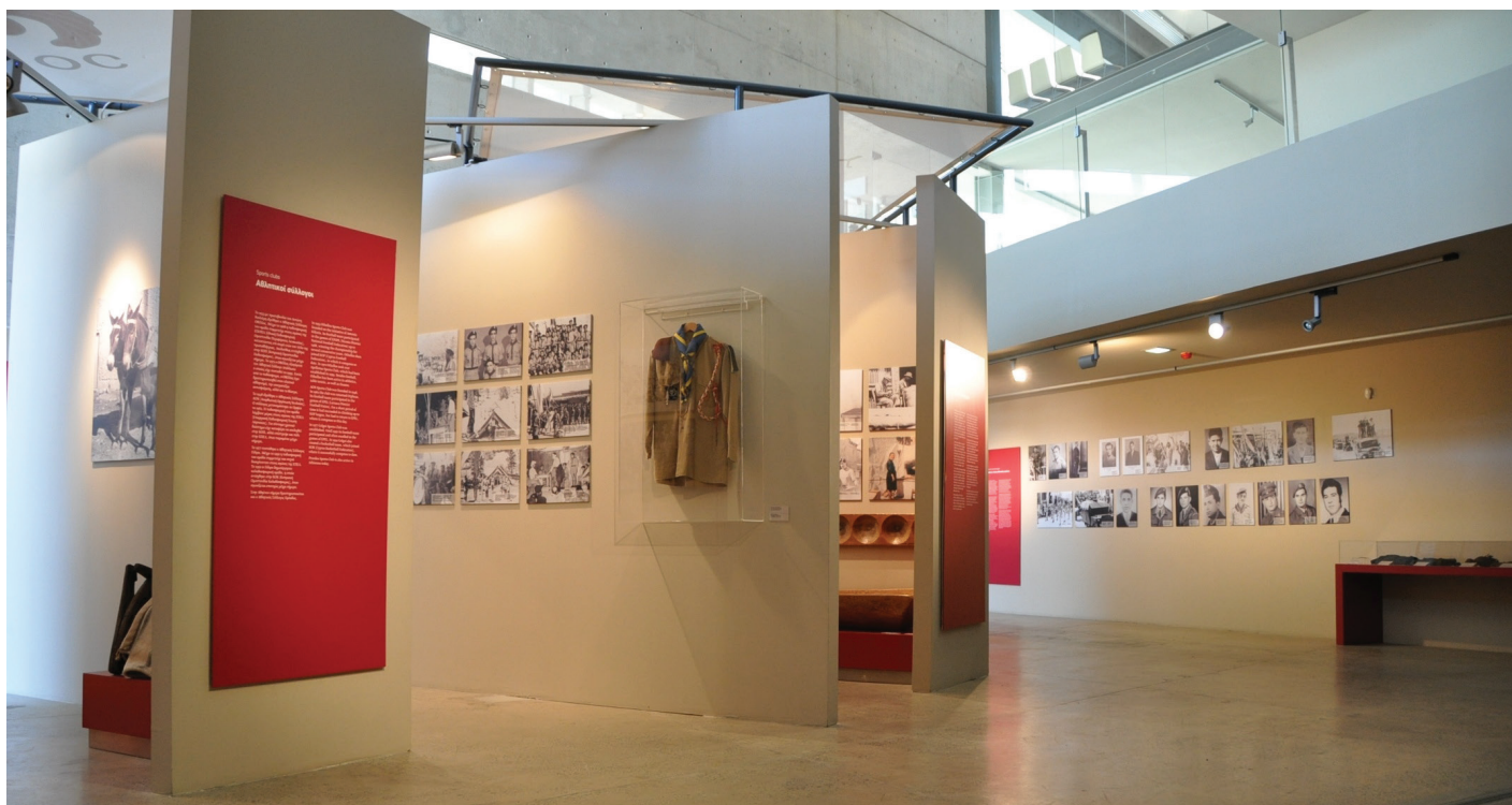
Figure 9. Kallinikeio Municipal Museum, Athienou. Ethnographic collections.