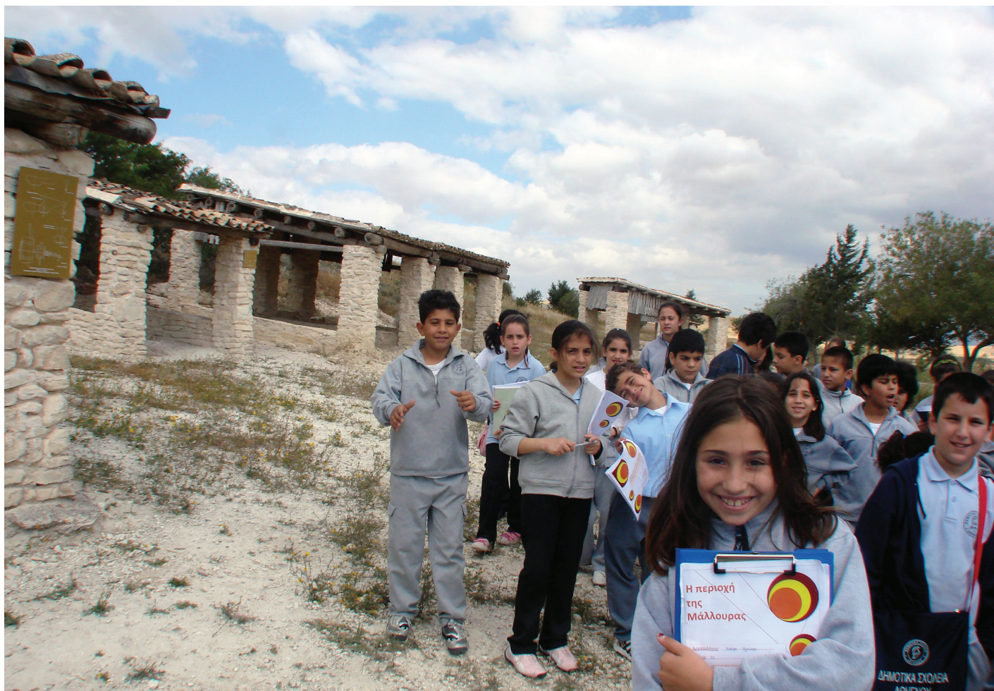
Figure 11. Grade school students from Athienou visiting the tombs at Mağara Tepeşi during a tour of Malloura.