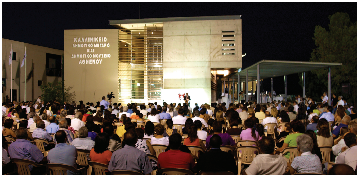
Figure 6. Opening ceremony for Kallinikeion Megaron, July 2009.